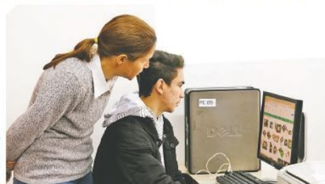
La profesora dando una reseña de cómo elaborar el trabajo en clase.

Por lo tanto, se realizó una donación que ese año va a totalizar USD 30.000 en el cual se va a proveer de equipos informáticos, acceso a internet, seguridad en cámaras y adecuación electrónica, también se equipará de herramientas como impresoras 3D, implementos electrónicos, soldadores y poder brindar los servicios de última generación para así llegar a progresar en sus carreras. Los chicos del